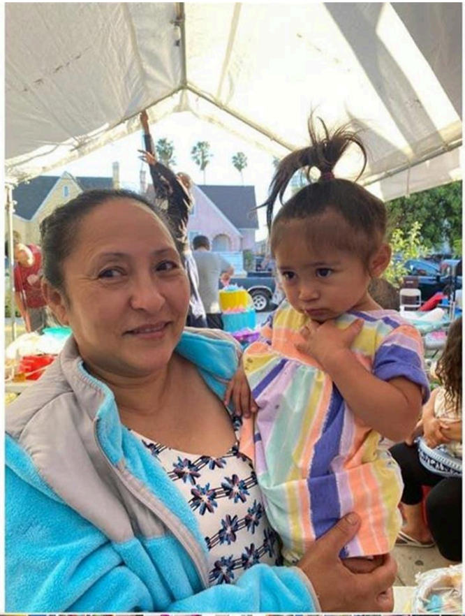
Grand Daughter and Ex Wife