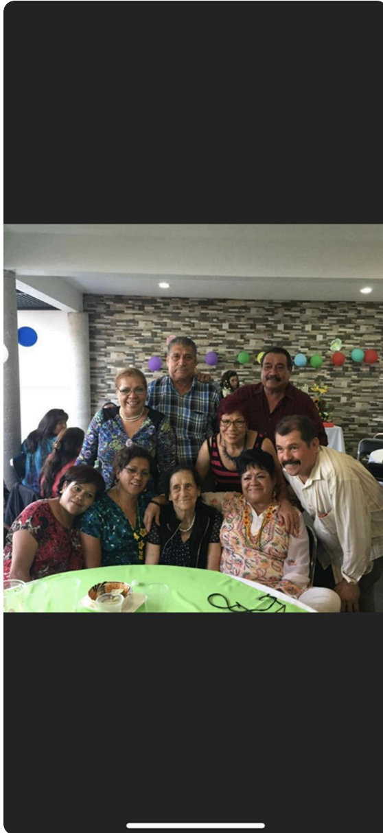
Dads Brothers and Sisters